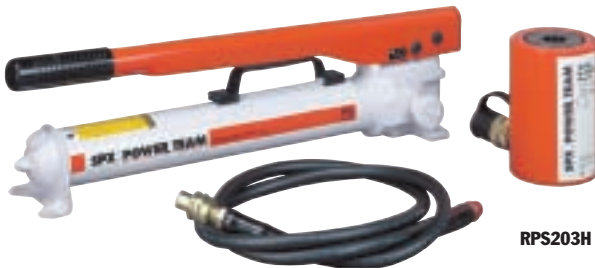
10,000 psi ASMEB30-1