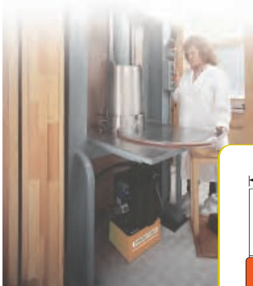
PE21 series pump and RD5513 cylinder used in a special press that produces pharmaceutical-grade extracts for herbal medicines.