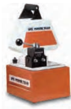
PE554W The new pump; weather-resistant.