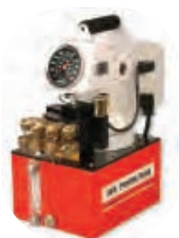
PE55TWP Torque Wrench Applications See page 162