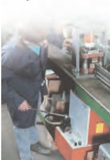
Hydraulic Machine Press Operation.