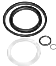
Viton* seal kits