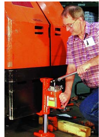
The J Series Toe Jack is an extremely rugged jack used here for lift truck service.